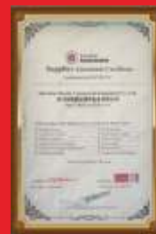
TUV&BV AUDITED MANUFACTURER