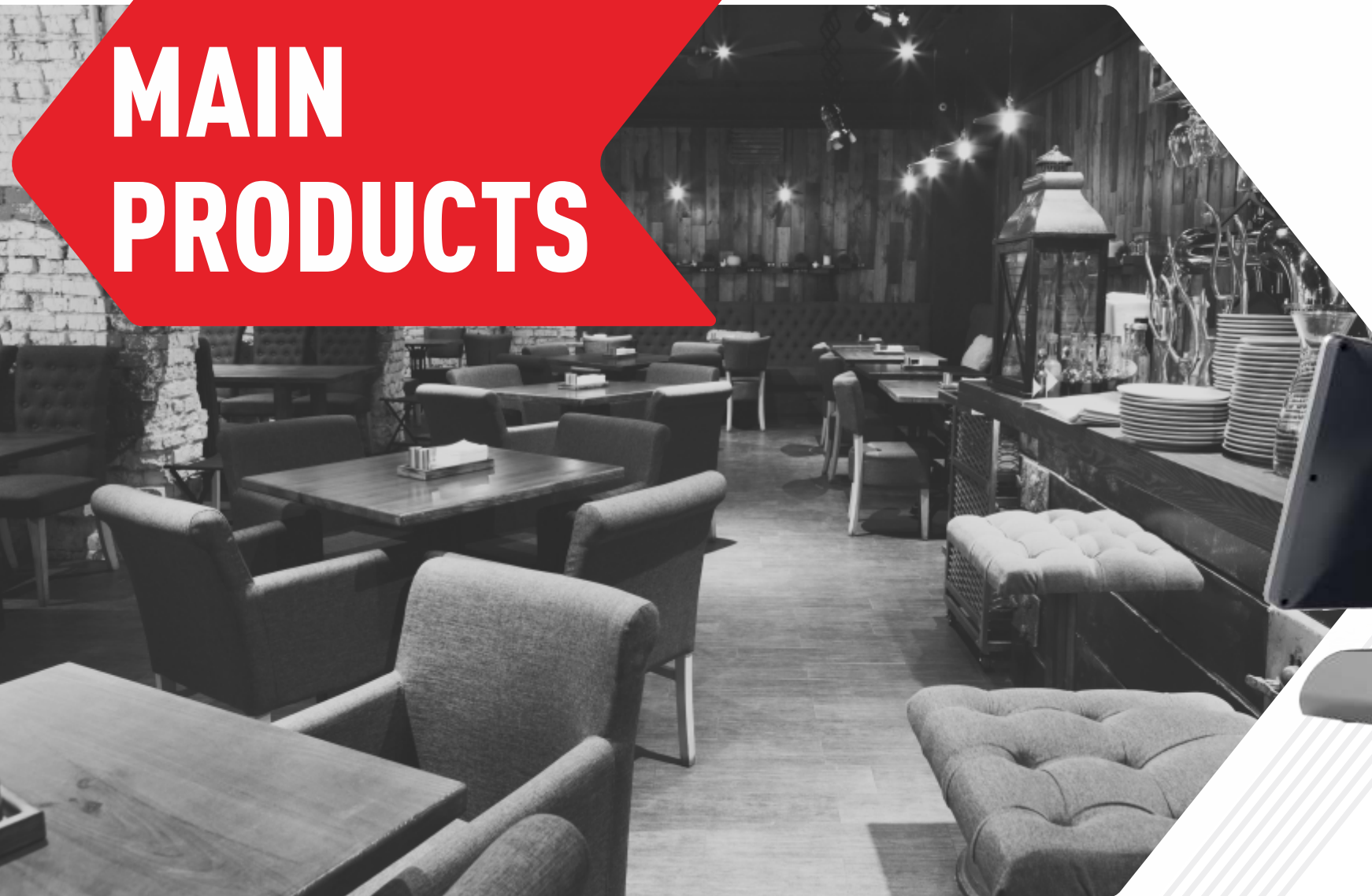
X200 Touch Screen POS System